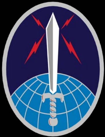
Schriever Space Force Base, CO