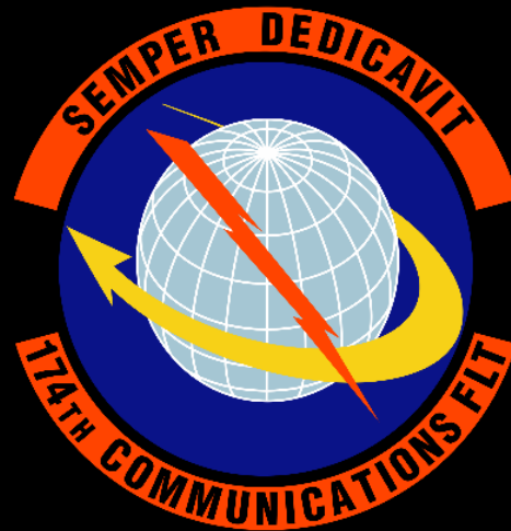
Hancock Field Air National Guard, NY