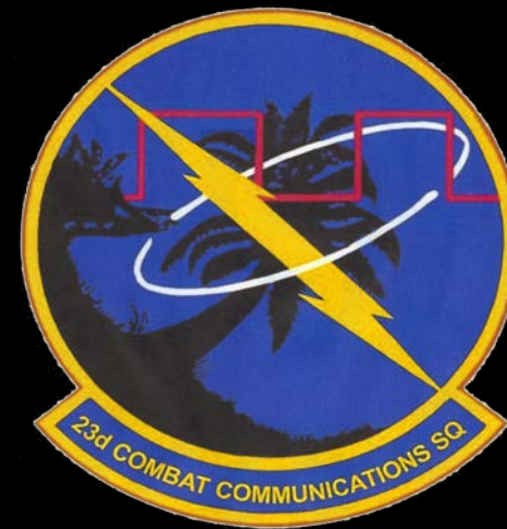
Travis Air Force Base, CA