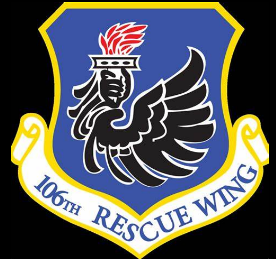
Francis S. Gabreski Air National Guard, NY