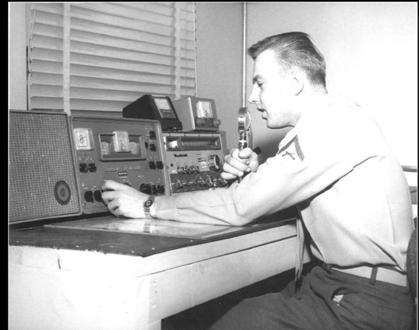
W6IAB – Camp Pendleton, CA